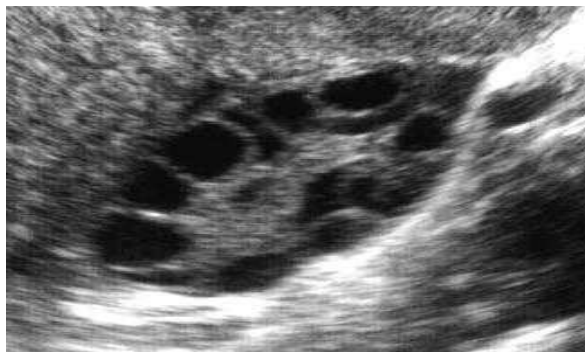
(Figure 1) Sonographic appearance of polycystic ovary