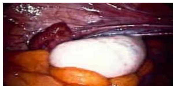
(Figure 3) Laparoscopic view of polycystic ovary

Laparoscopic view of polycystic ovary as shown in (figure 3).