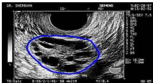
(Figure 2) Sonographic appearance of polycystic ovary

Laparoscopic ovarian drilling (LOD) has been widely used to induce ovulation in PCOS women after failure of treatment with Clomiphene Citrate (CC) and Human menopausal Gonadotropin (HmG). Laparoscopic drilling of the ovaries is an alternative treatment for patients with clomiphene citrate resistant polycystic ovary syndrome. This involves a single procedure, which has minimal morbidity, which can lead to consecutive ovulations with minimal risks of multiple pregnancy. Patients may also respond to clomiphene citrate after this treatment. The mechanism of action of LOD is not fully understood and therefore it is not exactly clear why some PCOS patients fail to respond to this treatment. A possible explanation is that the amount of ovarian tissue destroyed during LOD is not sufficient to produce an effect in some patients. However, others believe that ovarian diathermy works by increasing the sensitivity of the ovaries to endogenous FSH. Hence another possible explanation of failure to respond is an inherent resistance of the ovary to the effects of drilling (7,8,9,10) .