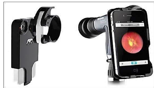
Figure 2: Photo-adapters for Smart phones for anterior and posterior eye segments photography

is aligned with the optical axis and placed close enough to the slit lamp eyepiece. There are also adapters designed to attach to the “Pan Optic Ophthalmoscope” for capturing fundus photos through an un-dilated pupil. It is even possible to take quality pictures of retina using only a Smart phones and indirect lens (8,14). The examiner can view the real-time images of the anterior and posterior eye segment with other practitioners, record and share their findings (15). A Smart phone using pinhole adaptor (Near Eye Tool for Refractive Assessment-NETRA) can be used to estimate the refractive error (Subjective Spherical Equivalent) without astatistically significant difference from subjective refraction (16). However, when interpreting examination results, the ophthalmologist should keep in mind that testing tools are not ideally standardized and should be used the eye care professionals using their professional experience and judgment (3, 8).