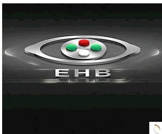
Figure 3: Eye Hand book application.

Eye Handbook is the most comprehensive iPhone application available on iTunes and Android Stores, which can be downloaded for free. This application can link to meetings and various societies, and ophthalmic instruments information. Several references to ophthalmic genetics, ophthalmic acronyms and eponyms, differential diagnosis and classifications, ophthalmic dictionary and mnemonics are also available (21,25). Important journals with access to their websites and contents are available on EHB. Treatment section of EHB has ophthalmic medications, preparation of the fortified antibiotics, and laser settings for ophthalmic procedures (27). Another part in EHB which is important for training is Free download of lectures, flash cards. Patient and physician educational movies are also available. The EHB is being used worldwide, with about 50% of downloads in North America, 20% in Europe, and 10% each in Australia and Asia (34) (Figure 3).